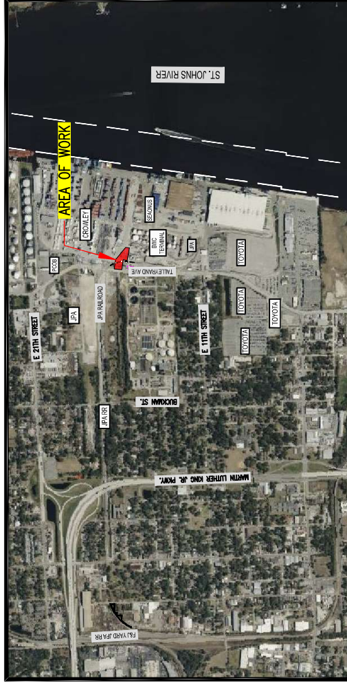
VICINITY MAP NTS