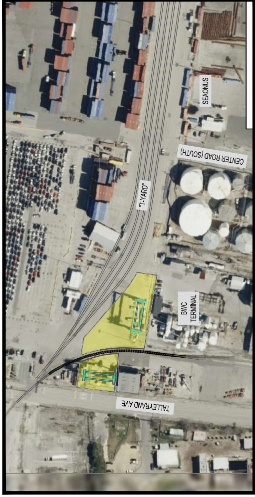
LOCATION MAP NTS