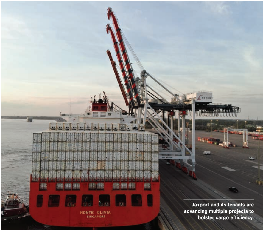
Jaxport and its tenants are advancing multiple projects to bolster cargo efficiency.