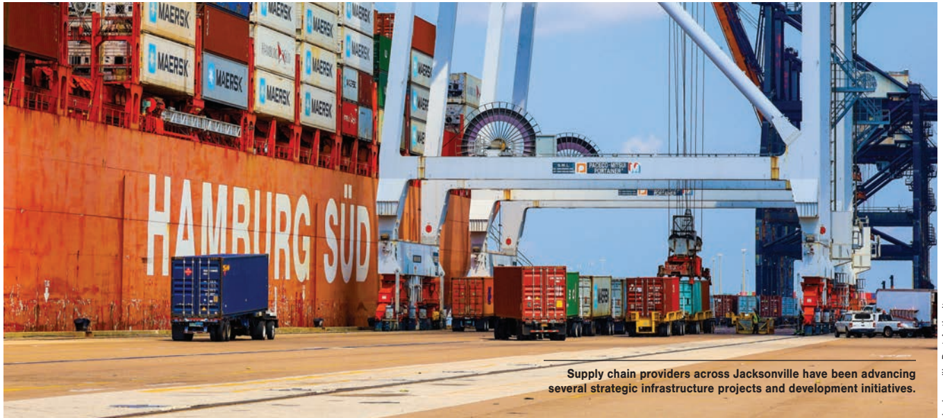
Supply chain providers across Jacksonville have been advancing several strategic infrastructure projects and development initiatives.